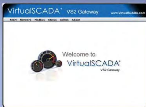
Actual Web-browser Screenshot