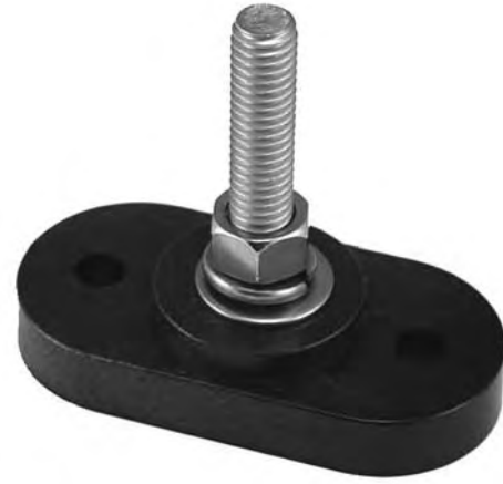
ST 710 38